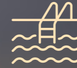
Adult Pool + Shallow Water Pool

Experience a lifestyle defined by exceptional comfort, renewal, and effortless convenience. Every detail is thoughtfully anticipated through our bespoke concierge services. Unwind in expansive, beautifully designed amenity spaces, or retreat to the serenity of your own private plunge pool, where true relaxation begins.