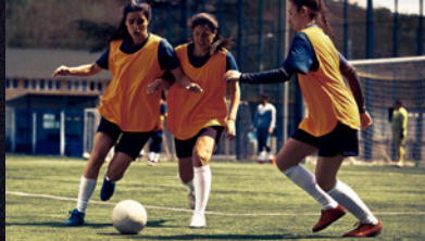
FITNESS & SPORT